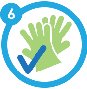
Put on Sterile Gloves