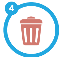
Remove "Dirty" Dressing