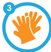
Put on Clean Gloves and Mask